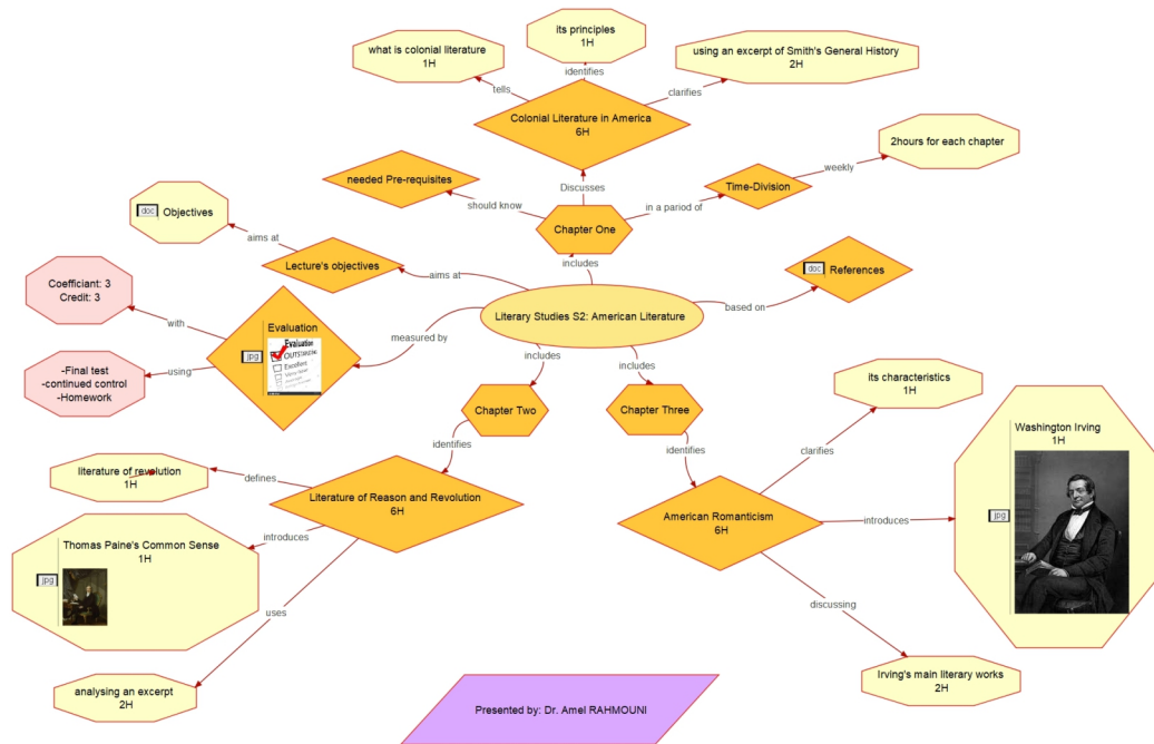
Lecture Mind Map