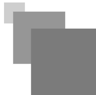
Table des matières